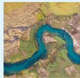
E-learning Course on Water Diplomacy and Integration of Water Norms in Peacebuilding