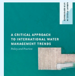
“A Critical Approach to International Water Management Trends - Policy and Practice.”