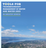
Tools for transboundary management of water and water uses in the greater Geneva