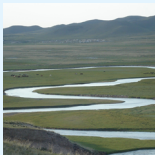
Summer School in Water Governance: Frameworks and Negotiations