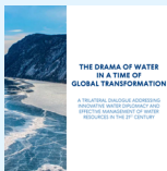
The Drama of Water in a Time of Global Transformation