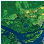
Online Course on International Water Law and the Law of Transboundary Aquifers