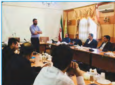
Workshop on Water Governance and Cooperation, Iranian Ministry of Foreign Affairs (Tehran, 2019)