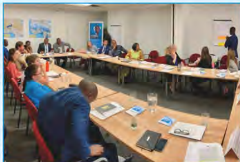
Workshop on Water and Peace in the Sustainable Development Agenda, Organisation internationale de la Francophonie (New York, 2019)

Please get in touch to discuss and co-design the training that suits you the most: research@genevawaterhub.org .