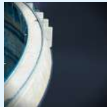
MOOC on Water Resources Management and Policy

As part of the Geneva Water Hub’s extensive alumni network, trained professionals form a community of practitioners to advance water for peace well into the future.