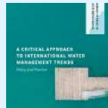
“A Critical Approach to International Water Management Trends - Policy and Practice.”