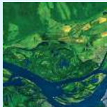
Online Course on International Water Law and the Law of Transboundary Aquifers