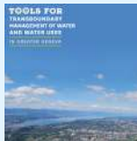
Tools for transboundary management of water and water uses in the greater Geneva