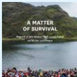
“A Matter of Survival”

The Geneva Water Hub knows that policy must be based on a solid understanding of socio-political processes , if it is to be credible, legitimate, and salient to political processes. The Hub examines how alternative messages may counter damaging narratives, how joint visions and benefits can counter inequitable arrangements, and the extent to which international norms and law are useful in realpolitik. It avoids oversimplification or the provision of simple “solutions” for convenience, even as it communicates these effectively to non-expert audiences. In doing so, the Hub sets the research agenda for water and peace critical and useful research .