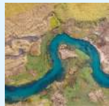
E-learning Course on Water Diplomacy and Integration of Water Norms in Peacebuilding