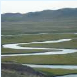
Summer School in Water Governance: Frameworks and Negotiations