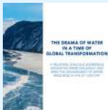
The Drama of Water in a Time of Global Transformation